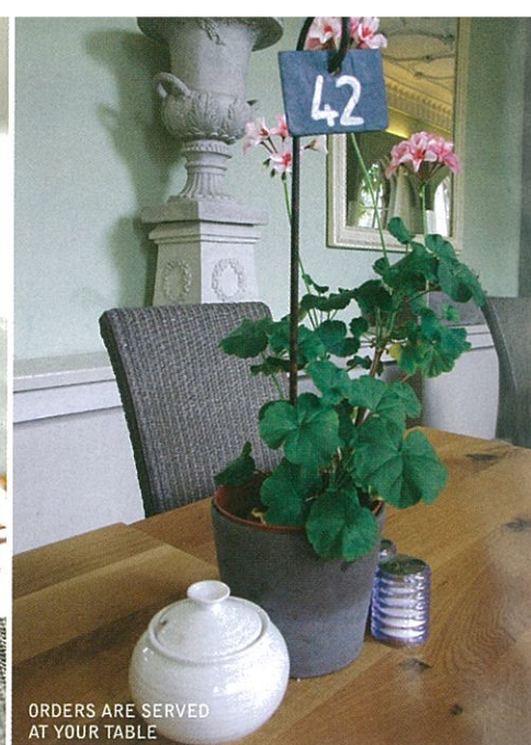
ORDERS ARE SERVED AT YOUR TABLE