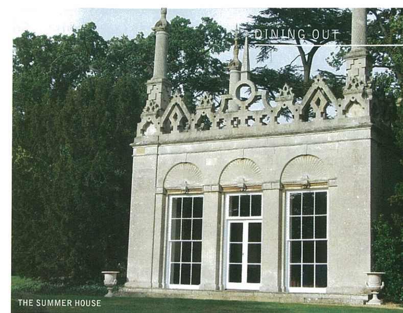
THE SUMMER HOUSE

Quite a legacy but the Orangery is rising to the challenge of creating food to complement its impressive backdrop.